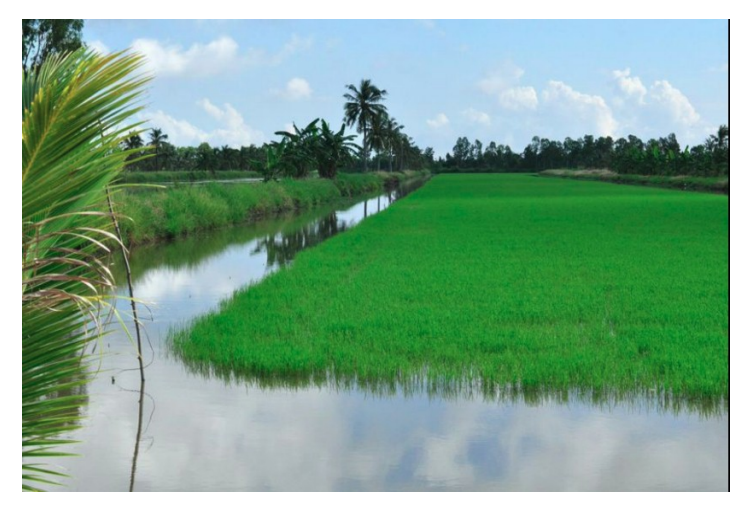
Typical rice-shrimp system in Kien Giang, Vietnam

grown in the rainy season (August to December). By the end of the shrimp crop, the saline water that accumulates during the dry season must be flushed out of the shallow ponds to prepare them for growing rice. machine-aided Since most solutions to remove saline from the soil prior to growing rice are too expensive for the average farmer, they depend instead on wet season rainfall (traditionally June-August) to flush salt out of the ground and successfully transition from shrimp to rice.